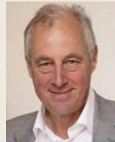
Mr. Tim Yeo Chairman The New Nuclear Watch Institute (NNWI) London, UK